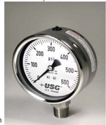
Figure 3: Model 656 100mm