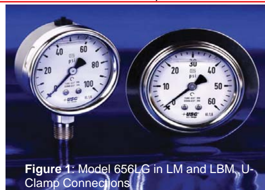
Figure 1: Model 656LG in LM and LBM, U-Clamp Connections