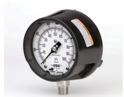
Figure 4: Model 1981 Dual Scale