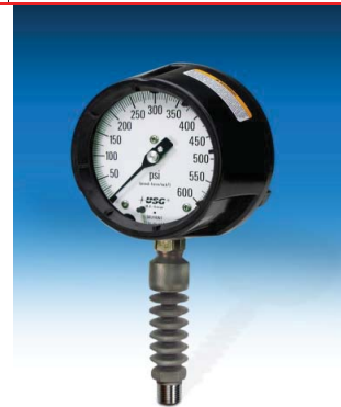
Figure 2: Model 1981 with Sta-Kool Cooling Element