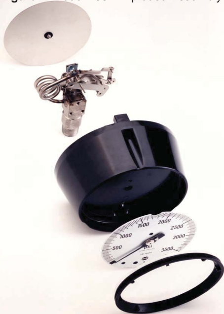
Figure 1: Model 1981 Exploded Assembly

LIQUID FILLING: The standard gauge is dry. Model 1981 is available with EZ-Fill configuration and factory-filled options. Total volume of liquid fill is approximately 1-1/2 pints. Standard fill fluid is Glycerin, with Silicone, Mineral Oil, and other fluids optional.