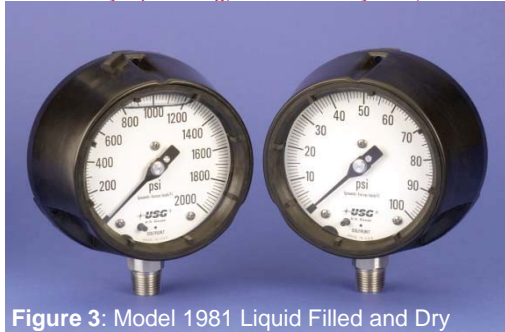
Figure 3: Model 1981 Liquid Filled and Dry